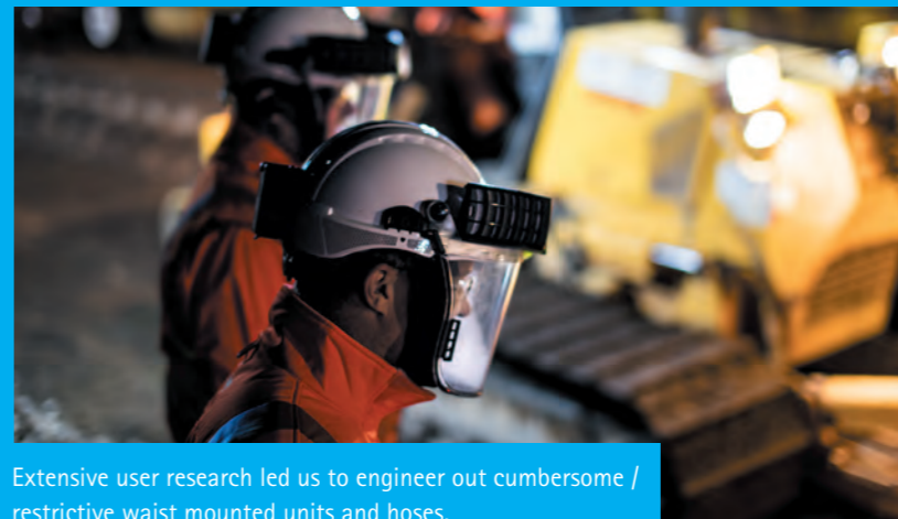
Extensive user research led us to engineer out cumbersome / restrictive waist mounted units and hoses.