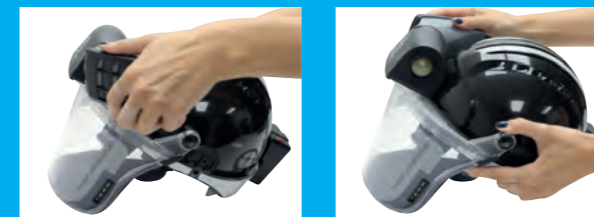
Easy twist off filters

Pre-filters will need changing more frequently followed by the high efficiency filter. The smart technology embedded in PowerCap® Infinity® will identify when the filters are blocked and need changing, however as a general guide pre-filters should be changed daily and filters weekly. The visor and skirt are parts that will also need periodic replacement. All parts are available as indicated in the replacement parts table.